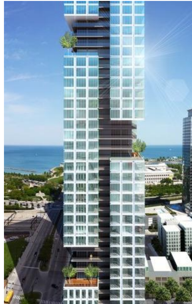
Natoma – Chicago